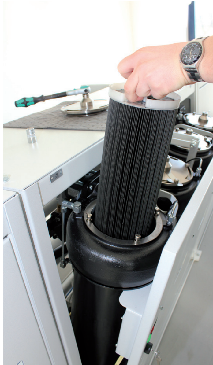
The core element of KNOLL MicroPur ® superfine filters is the filter cartridges that are regularly backflushed in an open-loop system. In case of wear, they can be replaced cleanly and in a very short time.

flushable filter cartridges. Handling the filter aids requires additional peripheral equipment. These requirements include the bag infeed, the automated and protected system for emptying the bags so that dust does not escape, fulfillment of legal explosion protection directives, and the required agitator for fluidization of the auxiliary medium that has to be applied as uniformly as possible to the filter cartridges. The system (complete with peripheral equipment) requires a larger installation space than a comparable system with backflushable filters.