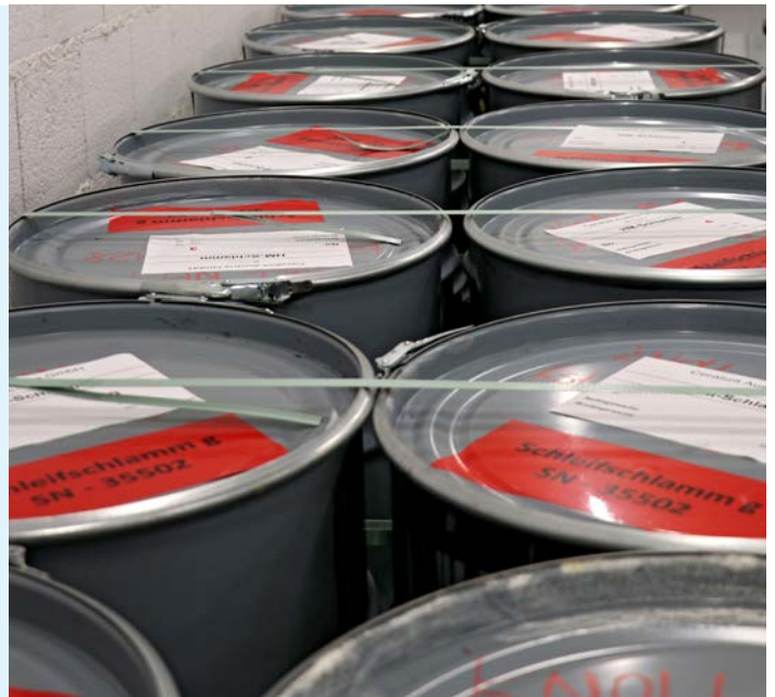
Each waste drum contains 400 kg of carbide sludge, which is processed at another CERATIZIT Group company and then reused in Kreckelmoos.

In order to minimise the risk of germ contamination, KNOLL developed a sophisticated flow control system for the cooling lubricant so that there are no dead spaces in the MicroPur® modules or in the tanks where the medium could accumulate.