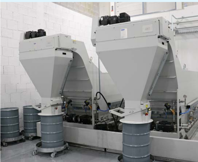
An important component of KNOLL filtration systems is the integrated automatic concentrator, which ensures that the carbide sludge ends up in the waste drum in a compact state.

Last but not least, the aqueous solution itself is of great importance. "In recent years, we have carried out extensive tests with our additive supplier and KNOLL in order to achieve the best results in cleaning and machining," reports Pfanner. "We