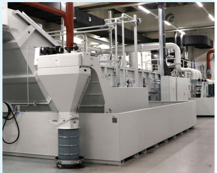
Growth prospects: The KNOLL MicroPur® system for oil filtration can be expanded to a capacity of 10,000 l/min.